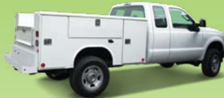
Aluminum Service Bodies