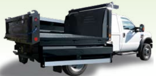
Drop Side Dump Body