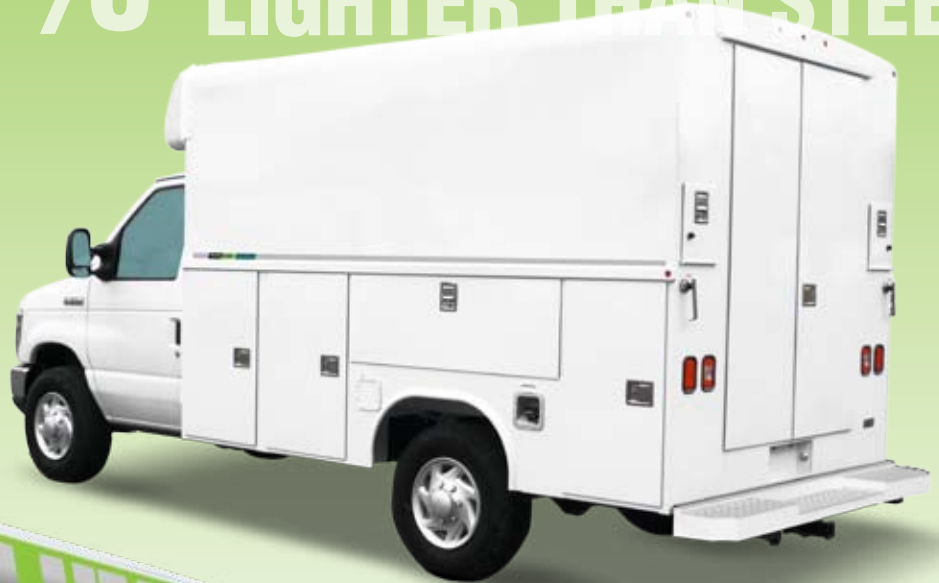
Shown with optional equipment.