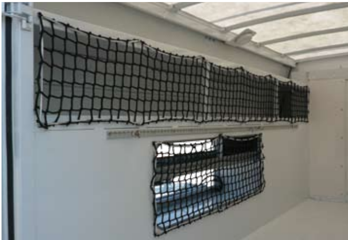
Horizontal compartment and upper shelf cargo netting