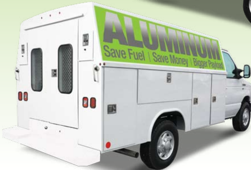
Shown with optional equipment.

The New Aluminum CSV gives you more of what you expect in a work van.