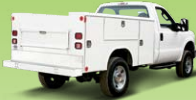
SL Service Bodies