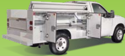
Classic II Service Bodies