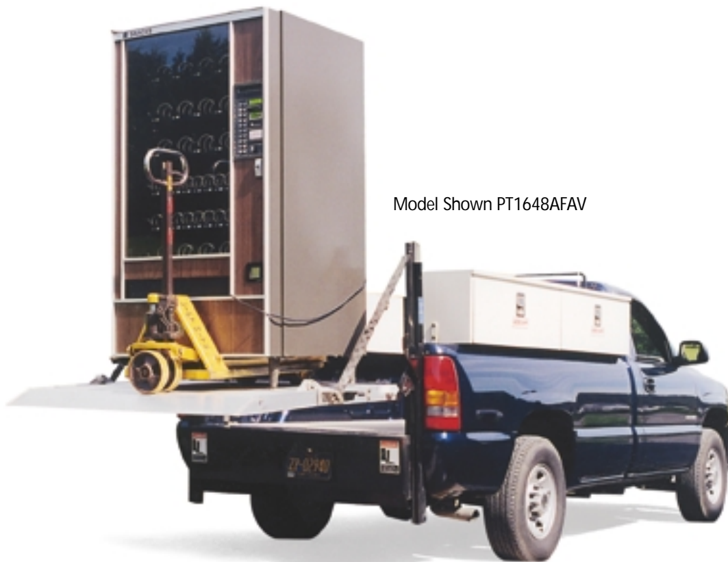
Model Shown PT1648AFAV

Tailored for the vending industry, this strong, durable liftgate is designed for transporting vending machines. Our rail style, chain-driven liftgate with a non-arcing level ride, will provide many years of reliable rugged service.