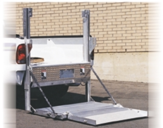
Optional all aluminum PT liftgate shown

Call 800-289-1335 in the U.S. 416-421-7987 in Canada