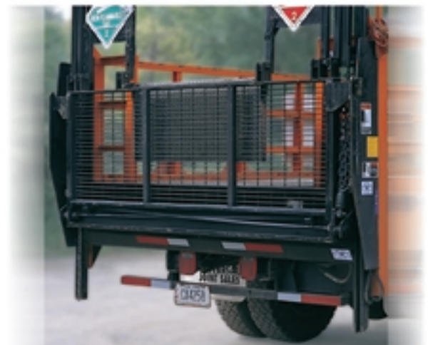
Optional steel bar grating shown

Call 800-289-1335 in the U.S. 416-421-7987 in Canada